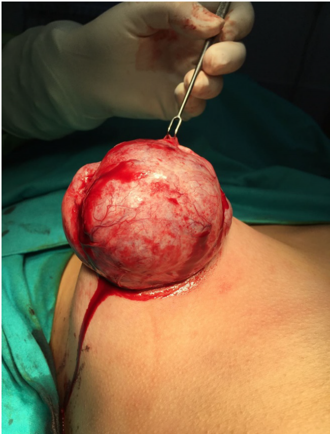
Figure 2 Preoperative view of the mass.