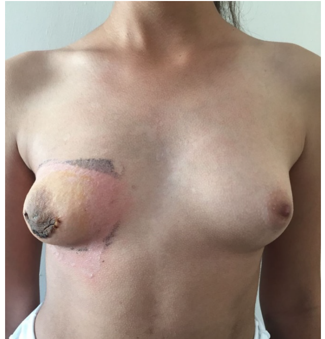
Figure 4 Postoperative view.