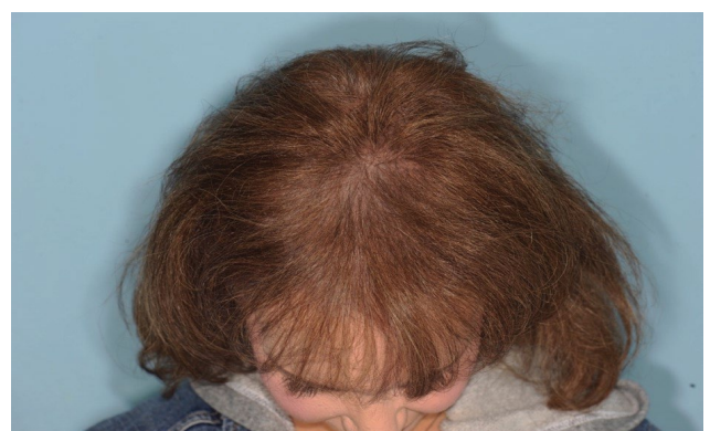
Figure 3 Female pattern baldness. This patient uses make up powder to camouflage her scalp so that the thinning is less evident.

generally placed along the hair line for a more natural look. Using this method, Epstein reported excellent results with minimal complications over a three year period [17].