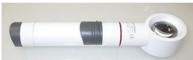
Figure 7 A densitometer can be used to estimate the hair density from the donor area.

Low-level light therapy: A Hungarian researcher discovered that by shining a low-powered ruby red laser on the backs of mice increased hair growth. This initial observation has led to other studies showing that low-level light therapy (LLLT) can improve wound healing, reduce inflammation, and reduce the symptoms of stroke [25-27]. The mechanism in which it improves hair growth is still unclear and there is a lack of good scientific studies to fully support its routine use [28].