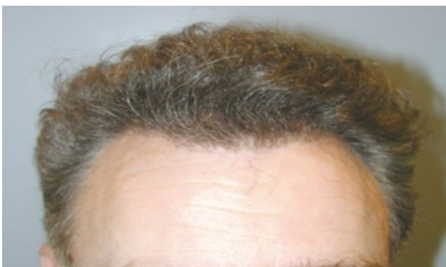
Figure 5b Same patient after FUT.