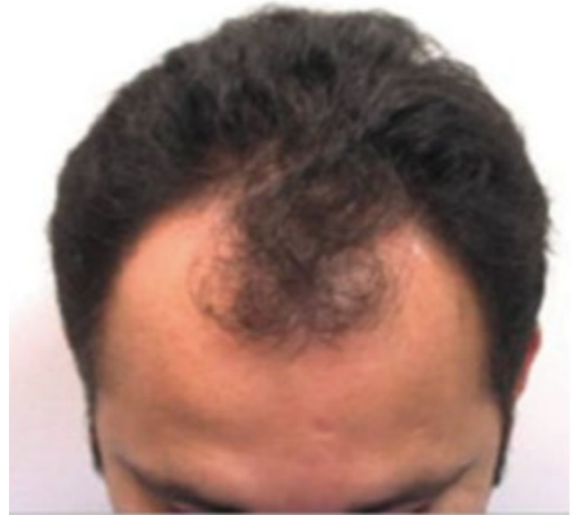
Figure 6a Another patient with male pattern baldness.