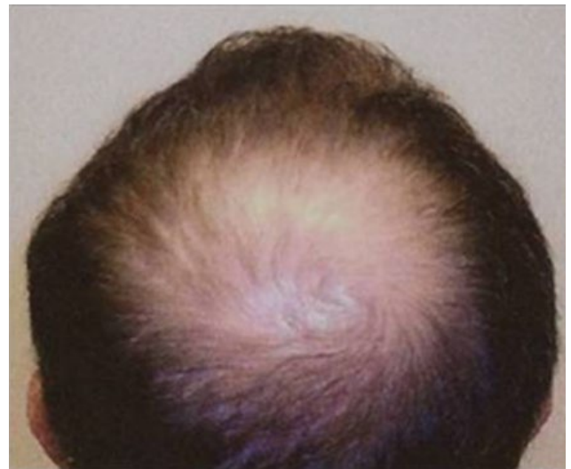
Figure 2 Male patient with baldness at the vertex.