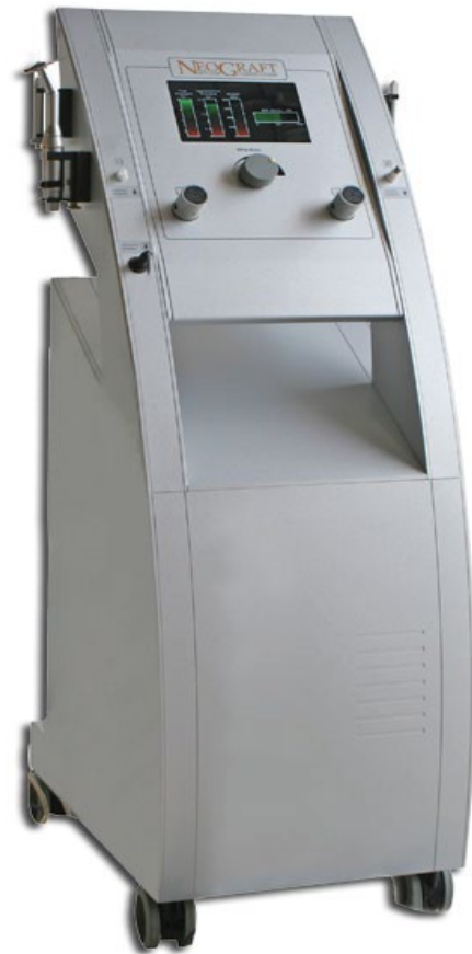
Figure 8 NeoGraft machine used for follicular unit extraction.