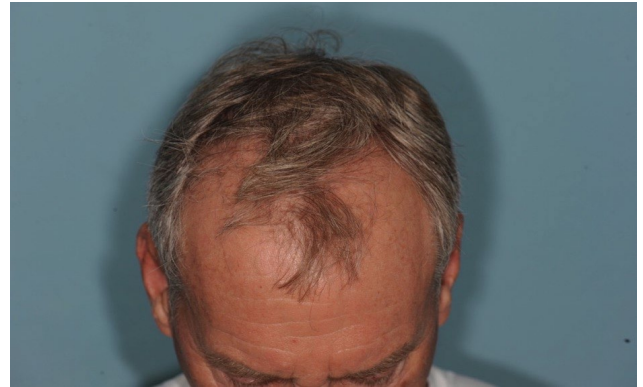
Figure 1 Typical male pattern baldness.

The strip is then separated into fine slivers about 2 to 3 follicular units wide. This is performed under a microscope or with magnification. The individual slivers are then sliced into individual follicular units and separated into piles based on the number of terminal hairs. The grafts are then implanted into the recipient sites with careful attention paid to the direction of hair growth and placement to ensure a natural appearance. Recipient sites are created with needles or specialized scalpels. Single hairs are