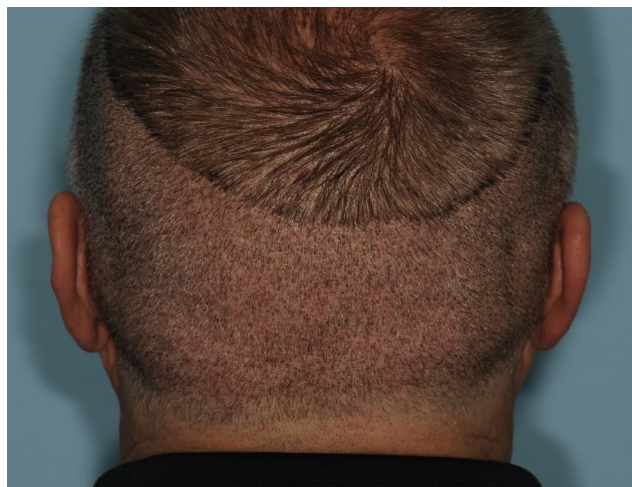
Figure 9b Same patient showing the donor area after a FUE procedure using the NeoGraft machine at 1-week post-op.