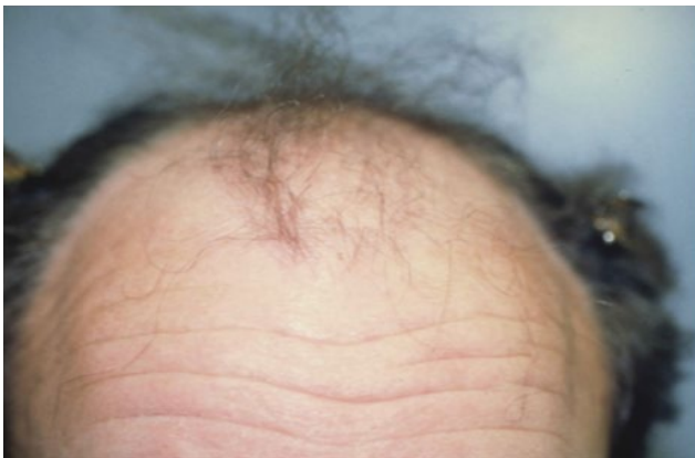
Figure 5a Patient with male pattern baldness.