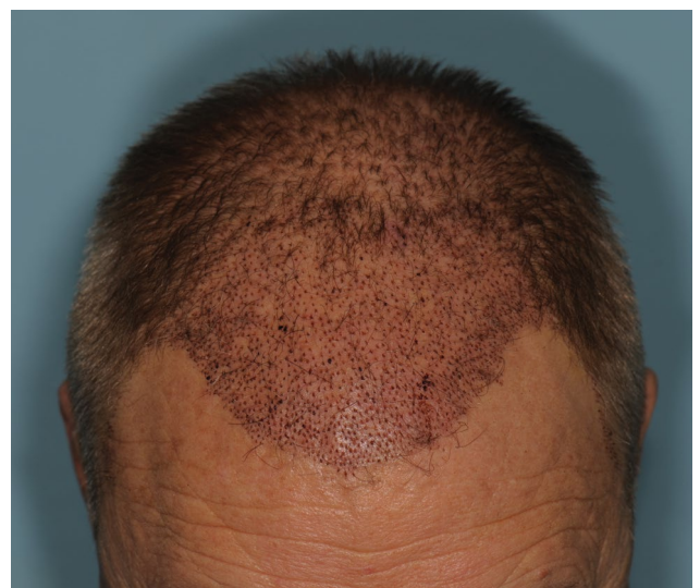
Figure 9a Patient with classic male pattern baldness who had a strip procedure in the past and desired another procedure to increase density in the frontal area. A FUE procedure was performed utilizing the NeoGraft machine for 2500 grafts. This picture was taken 1-week post-op.