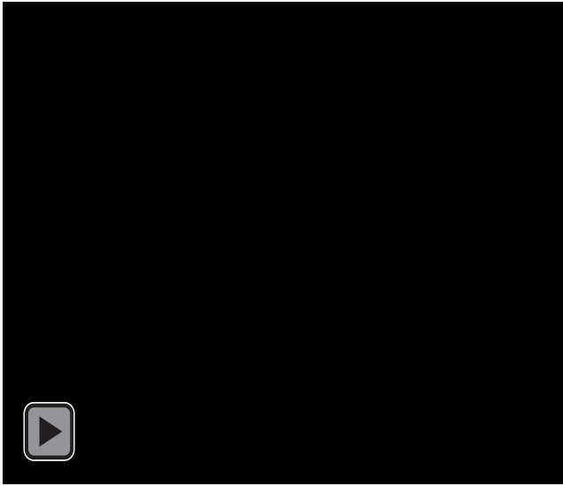
Video 1: Submental plication demonstrating ease of dissection, similar to a skin flap previously untreated with EBD.