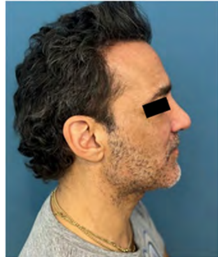
Figure 3: 4-weeks following submental plication, the 55-year-old-male is pleased with the outcome of the helium plasma RF treatment and subsequent submental plication.