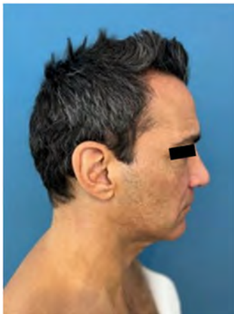
Figure 1: Before image of a 55-year-old male presented with mild neck laxity.

A 55-year-old male presented with mild neck laxity ( Figure 1 ) and a helium plasma RF treatment was performed to the neck and jawline, procedure details were 60% power, 1.5 L of helium flow and 10 kJ to each side. Four months following the helium plasma RF treatment, the patient had a slight wrinkle on one side of the neck and expressed interest in surgery ( Figure 2 ). Four months post-helium plasma RF, the patient underwent submental plication under local anesthesia. The procedure was straightforward with a clean dissection plane. There were no issues in the tissue from the previous helium plasma RF procedure. The patient was very pleased at four weeks post submental plication ( Figure 3 ).