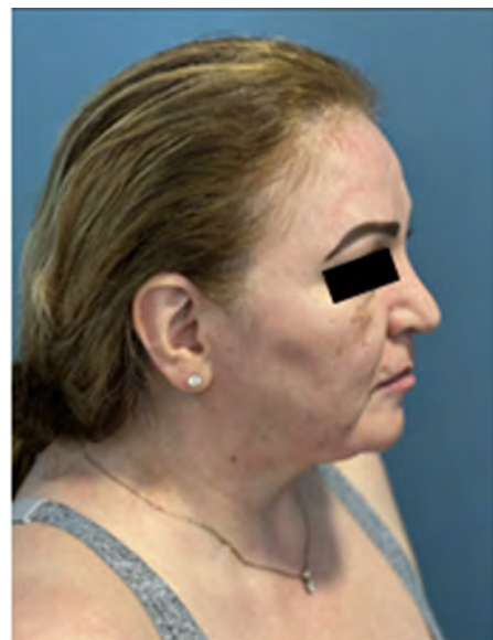
Figure 3: 4-weeks following submental plication, the 55-year-old-male is pleased with the outcome of the helium plasma RF treatment and subsequent submental plication.

A 57-year-old female presented with significant submental and neck laxity ( Figure 4 ) and a helium plasma RF treatment was performed to the neck and jawline, procedure details were 60% power, 1.5 L of helium flow and 10 kJ to each side. The patient had a pre-existing scar under the chin from a childhood injury which had left a dog-ear and sought corrective surgery. Four months following helium plasma RF ( Figure 5 ), submental plication was performed under local anesthesia. Intraoperatively, the tissue was clean, supple, of excellent quality and easy to dissect ( Videos 1 and 2 ).