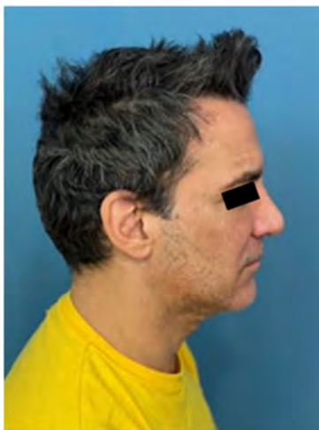
Figure 2: 4-months following helium plasma RF, a 55-year-old male presented with a slight wrinkle on one side of his neck, desiring surgery.