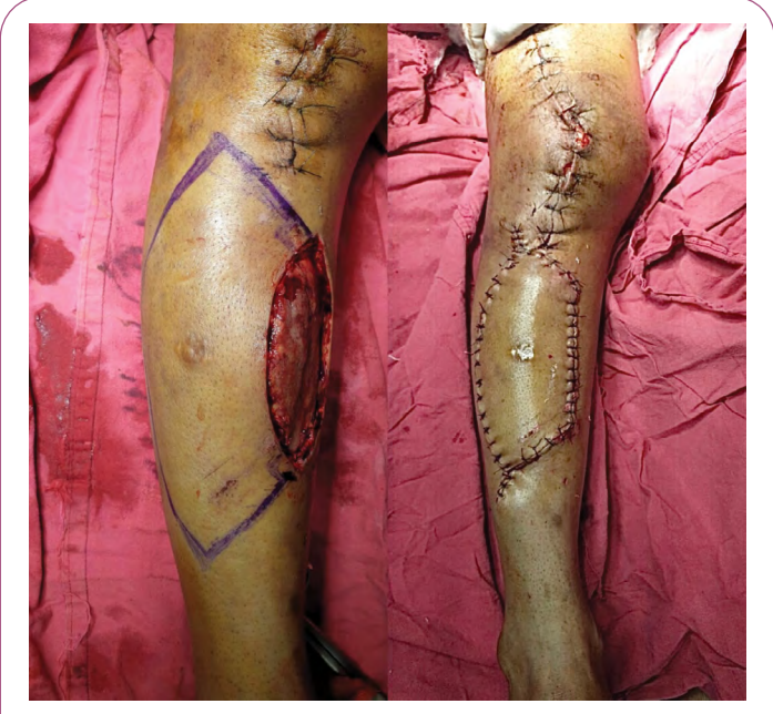
Figure 3 Flap design in another patient.

microvascular options that require a wide learning curve and large resources for its execution. KF technique has limitations. Its efficiency in intraoral and intranasal coverage has not been sufficiently proven. Its fasciocutaneous and musculocutaneous nature lacking bone components excludes them from scenarios with these specific requirements. Besides, due to its vascular dependence on perforators, caution should be exercised in areas surgically or traumatically dissected [6,7]. As in any other technique, the design of the island must be careful to avoid transgression of natural folds or scar location on areas of excessive pressure. To do so, it is recommended to design larger islands as previously mentioned (Figures 2 and 3).