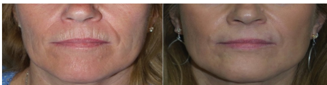
Figure 2 Patient #2 (A) Before treatment. (B) 18 months after facial resurfacing treatment.