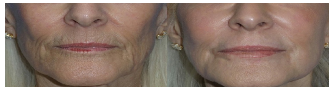
Figure 4 Patient #3 (A) before treatment. (B) 9 weeks after facial resurfacing, autologous structural and nanofat grafting with PRP injection.

Attention was then directed to resurfacing of the facial skin. The upper and lower eyelids were addressed with one pass of the plasma device 20% power with 2 liters of helium gas flow. The forehead, nose, cheeks, and lower-third of the face down to the mandibular border were treated at 30% power with 3 liters of flow. The perioral region and its deeper rhytids were treated at 40% power with 4 liters of flow. A second pass around the mouth at 20% power and 2 liters of flow was done until tissue response was deemed sufficient. After cleaning the skin, a polyurethane mask was customized to fit the patient, and a mildly-compressive